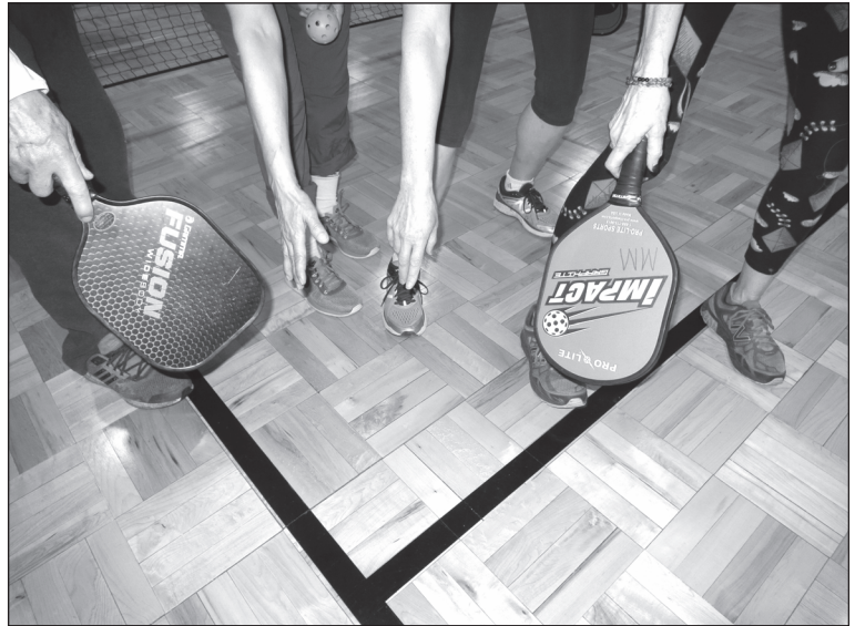
Happy hands point to new pickleball striping at 10th East Senior Center.

Bad news for youngsters though: while play is free for seniors, those under 60 get to play for $2. Weekdays except Thursday, 2:30-4:30 p.m. Wear shoes which won't mark up the hardwood floor. Paddles are available at the Center. Plenty of parking in the rear of the building at 237 S. 1000 East, 385-468-3140 for details about times.