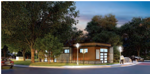
Architectural renderings by CRSA Architecture for the 4th Avenue well project.

Residents have significant concern about the impacts of the 4th Avenue Well Project to their neighborhood. The City Council asked Public Utilities to reduce the building size and other impacts of the well rehabilitation project. Public Utilities is developing potential alternatives that address community concerns and needs including building size, aesthetics, noise, tree removal, loss of open space, and safety related to the proposed use of liquid sodium hypochlorite (bleach) as a disinfectant. Public Utilities states their obligation to protect the public health and safety of its drinking water, and has determined that the 4th Avenue Well must receive disinfection to meet this obligation. The Utah Dept of Environmental Quality is also considering mandating that water from the 4th Avenue Well be disinfected prior to its entering the distribution system.