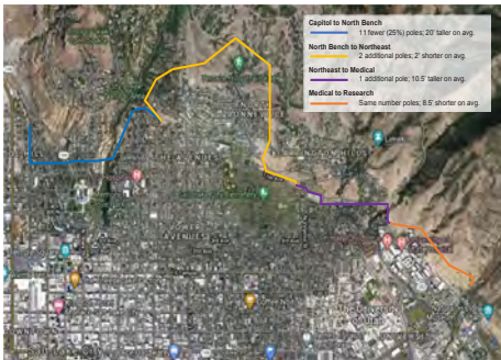
SLC Foothills Wildfire Mitigation Transmission line project (46 kV wood modified to 138 kV steel)